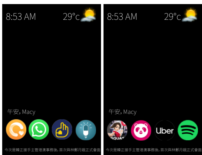
Mirrorgotchi User Interface (Preinstalled with 12 Apps)