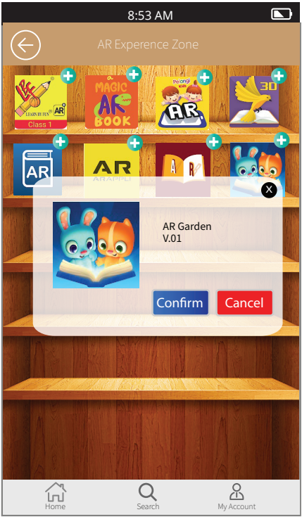
LIBRA 4.0 AR APP UI (for reference)